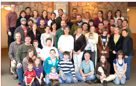
Our fellow hostages at MTI (several days after the hostage simulation)

That is exactly what we did last Wednesday in our hostage simulation at Mission Training International (MTI) in Colorado. For the past three weeks we've been acting in role plays, sitting in lectures, taking personality inventories, participating in group discussions, and even hiding in wooden crates to learn about the ways that living on the mission field will affect us and to prepare for those effects. It's been an interesting and emotional ride and we're definitely going to walk away with lots of experiences and information that will be invaluable to us in Guinea-Bissau.