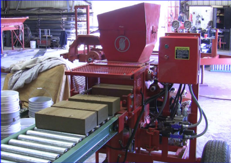
Pretty amazing that a machine this size can crank out 300 blocks an hour!

This month I attended a two day crash course in San Antonio on how to make buildings out of dirt. Donors that wish to stay anonymous donated a machine to YFC that makes building blocks out of dirt! When I left for the training I didn't know much about the machine, but I thought that it would simply automate the process of making the sun dried cement block we're used to building with in Bissau. Not so! This machine makes something called a "compressed earth block". It cranks out about 300 blocks per hour from just smashing the right kind of dirt! It compresses the dirt about 2x and the blocks are strong . They can hold a tremendous amount of weight and the walls are even bullet-proof! Not bad for dirt, eh? Another lovely feature of this kind of construction is that the walls are so dense they store thermal energy. So, in the afternoon when the sun is the hottest, the walls will still be cool like they were at 8am. That's the part I'm most excited about!