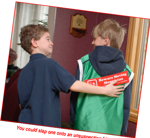
You could slap one onto an unsuspecting friend...