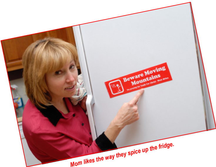
Mom likes the way they spice up the fridge.