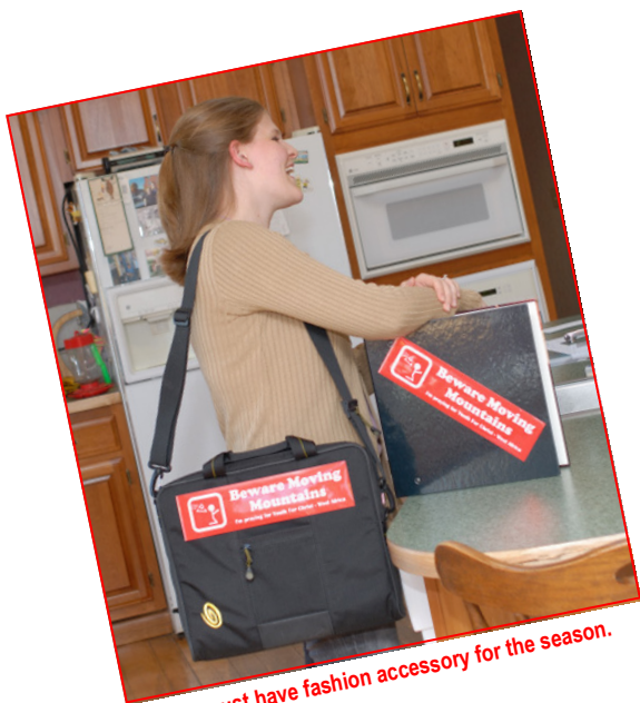
The must have fashion accessory for the season.