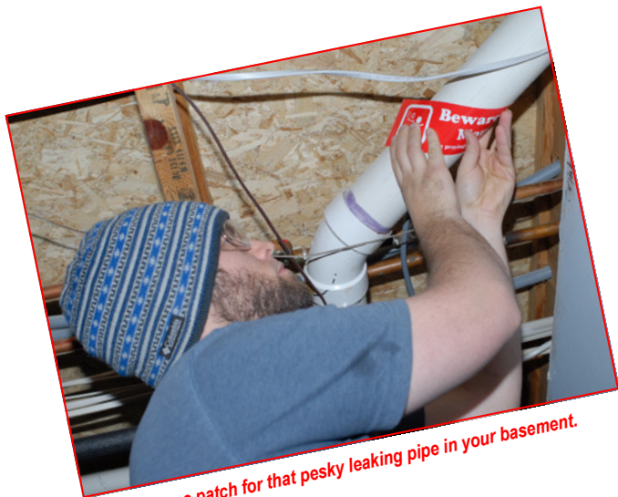
Or, as a patch for that pesky leaking pipe in your basement.