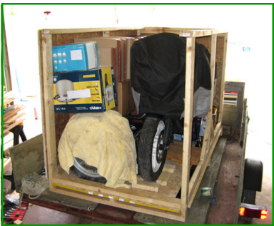
This is the halfway point...