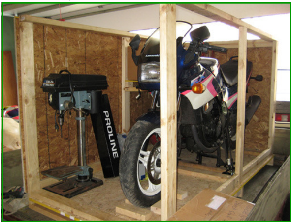
First things first, we packed the new bike and some large tools.