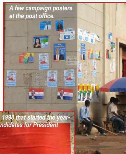
A few campaign posters at the post office.