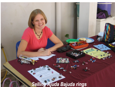
Selling Ajuda Bajuda rings