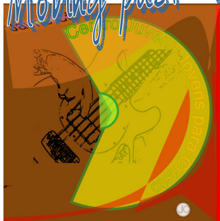
One student's CD cover design. Not bad for a first try!

This month I test-taught a new class in the Computer School. The class was about a free graphic design program, and the students really seemed to like it! It's a little more complicated than our normal Office software classes, so we only took grads, but we had a great time. I have seen a lot of basic designs that were obviously from novice WordArt users all over the country (including a rainbow colored patch of text on an official government document), so it was fun to be able to give the students some tools to do some less cookie-cutter design work. There are a lot of CD covers, logos, and various other things to design in Bissau, and now we have a batch of students who at least have some basic abilities in that area.