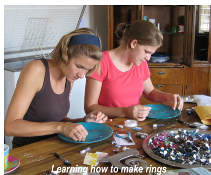
Learning how to make rings