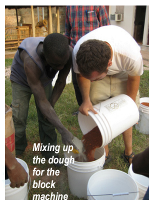
Mixing up the dough for the block machine