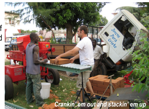
Crankin' em out and stackin' em up

The equipment and materials that came over in the container will be a big blessing for us and for Guinea-Bissau. Thanks again to everyone who was involved!!!