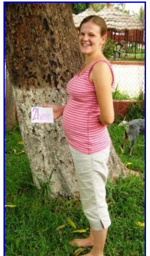
21 weeks-more than half-way! Baby girl is growing like a weed and I am too!

We Want to See You!!! We are going to be coming back to the US at the end of July! We'll be home until early 2011, so if you would like us to speak at your church or small group let us know!