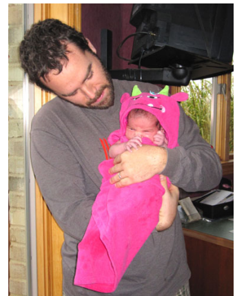
Looking quite monster-ish in her monster towel after bath time