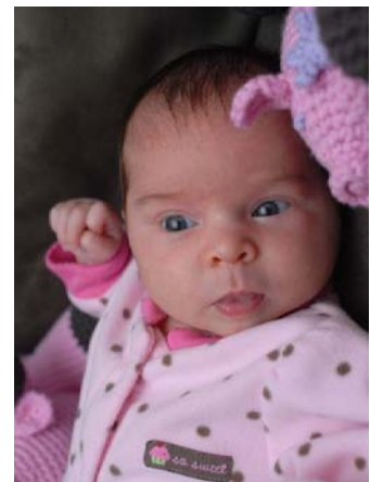
One month old and totally adorable