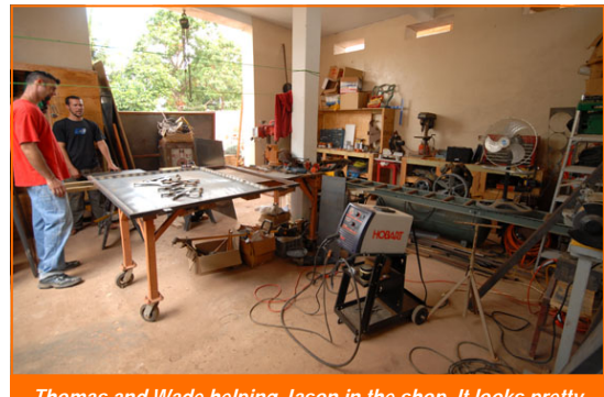
Thomas and Wade helping Jason in the shop. It looks pretty nessy but it is 1,000 times better than it was and it's getting more and more organized every day