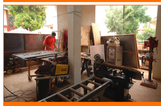
The shop from the back corner looking outside. One of the projects that Jason's currently working on is making rolling barn doors to cover those two huge openings