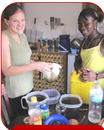
When you buy raw honey fresh from the bee hive you have to filter out all of the bee parts and whole bees that come in it