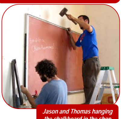
the chalkboard in the s