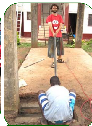
Pulling the last cable at the end of the day