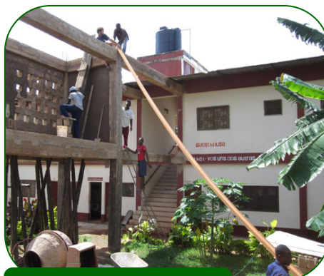
Hoisting a giant steel I beam up to the top of the solar structure

In the next month Jason hopes to get the security fence and razor wire installed and start getting the solar panel mounts welded together.