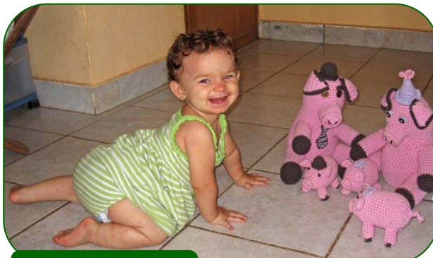
That's right, baby girl is crawling... everywhere