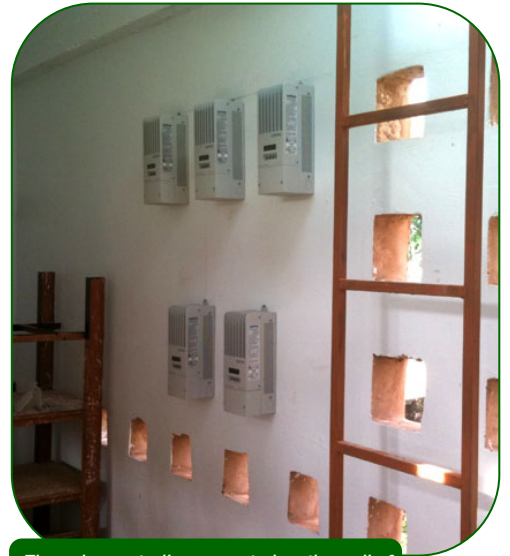
The solar controllers mounted on the wall of the controller room. Another step closer!