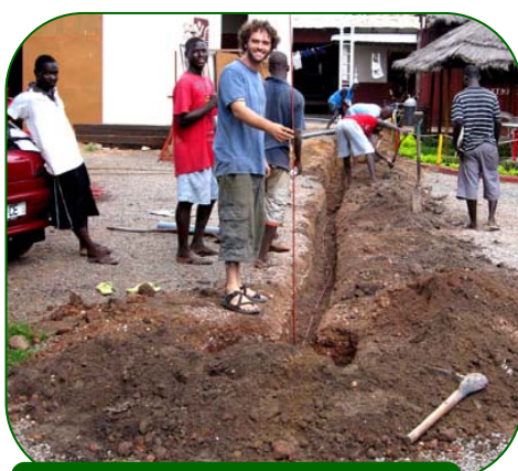
Digging the trenches to lay the pipe that will hold the wiring for the solar power system