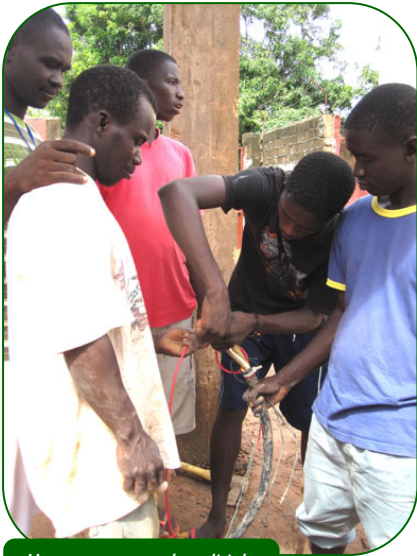
How many guys does it take to fix a disconnected cable?