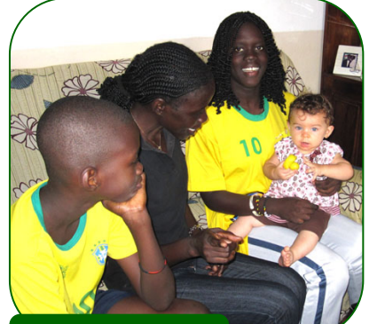
Munching on her rubber ducky with some friends