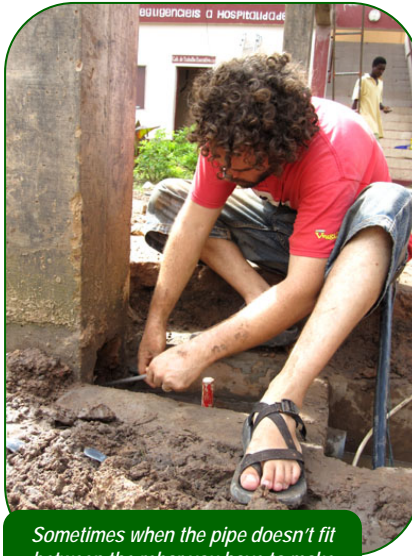
Sometimes when the pipe doesn't fit between the rebar you have to make a few adjustments with a hacksaw ☺