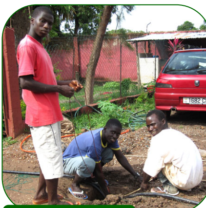
Getting ready to feed the wire into the underground pipes