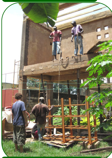
Hmmm, how are we going to get this 200 pound battery rack up here