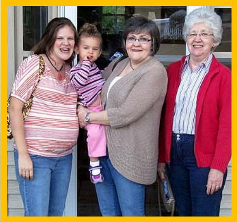
A four generation shopping trip – four first-born girls. Watch out Target, here we come!