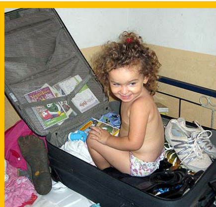
It's amazing I ever got our packing finished