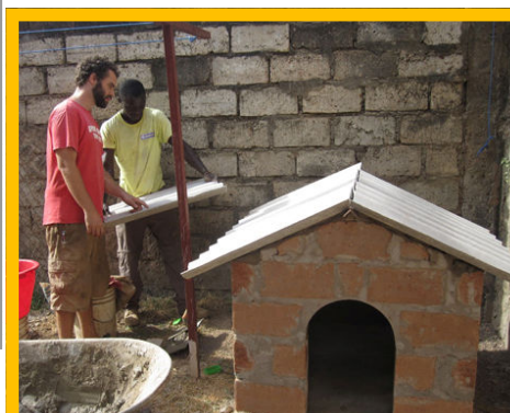
Our dog Sydney's new house under construction