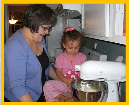
Cooking lessons with her Grams!