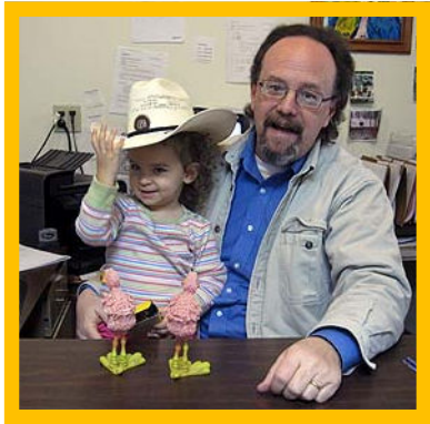
Catching up on some cowgirl time with Grandpa