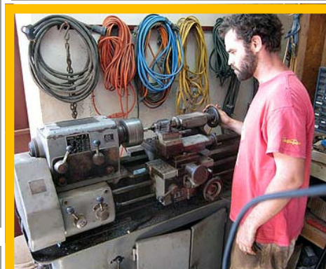
The new (to us) lathe in action