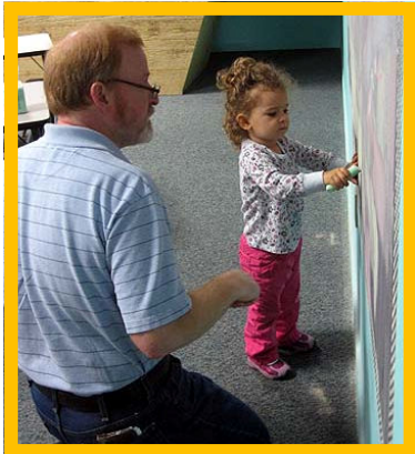
Learning about chalkboards with her Pops!