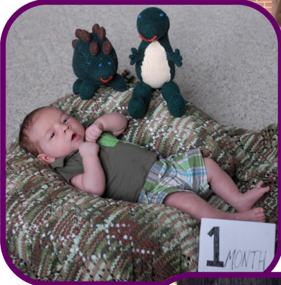
Our precious boy with his dinos.