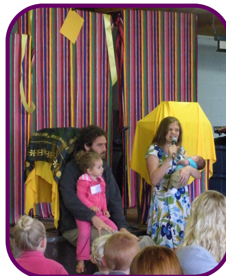
Speaking to the kids in Hastings' House at Simpson Park Camp.

Several kids asked questions about daily life in Africa, including one little boy who asked if we ever have to defend our pet gazelle from jaguar attacks ☺.