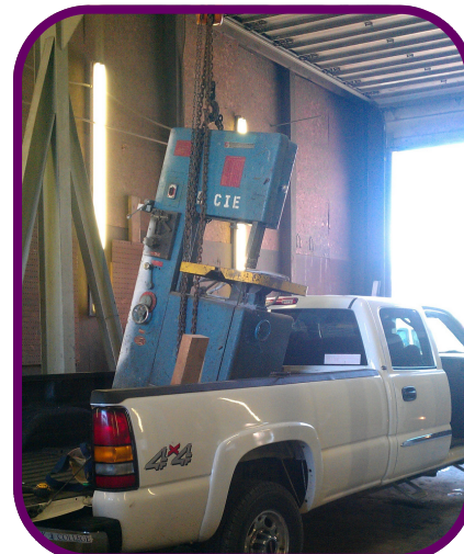
A tough old vertical band-saw Jason picked up for our shop in Bissau.

I've continued to scour local (and less local) auctions for good machine tools to take back to Bissau and I've scored some incredible bargains! The saw pictured here was an eBay find that wasn't well listed so everyone else ignored it. I paid $100 for it, and then a day and fuel to drive to Ohio to pick it up. The same model at another auction I attended went for $1,030!