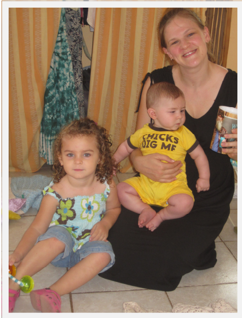
Taking a break from cleaning and unpacking to have a glass of sweet tea and a snuggle.