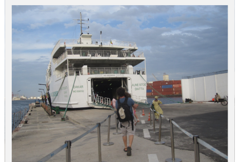
Getting on the overnight ferry to the south of Senegal.