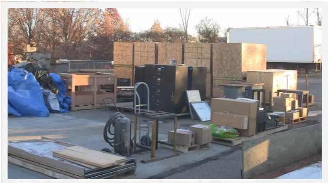
The well organized mountain headed to Guinea-Bissau in our shipping container.

With lots of help and no small amount of borrowed ingenuity, we managed to get everything we hoped to get into the container! It was loaded at PTL Engineering in Lapeer. A semi with a flatbed trailer brought the empty container, backed it up to the loading dock, and four hours later, drove it away full of equipment and goodies for several different families and ministries here in Guinea-Bissau. The container was carried by truck to the Detroit train station, where it was loaded on a train bound for New York. From there, it was loaded onto a ship across the Atlantic headed to Brussels on December 5, to arrive here in the port of Bissau on Christmas Eve! Once it arrives we'll begin the 6-8 week process of clearing the paperwork to be able to rent a truck here to bring the container to us. Very exciting!