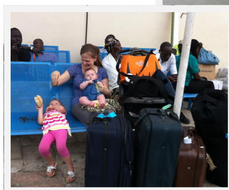
Waiting to get onto the boat, tickling my little bread-munching frog ☺