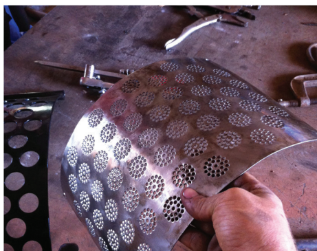
The tough new screen to modify the hammer mill (designed to fit into the black piece on the left)