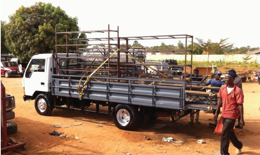
The newly-redesigned WAVS truck loaded with shelving and roof trusses for the filter factory