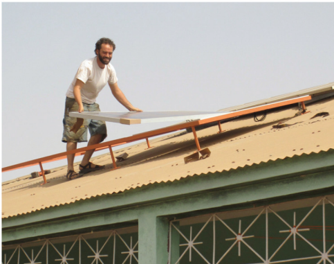
Installing four solar panels on our house to help with the extra power needed for all of our guests