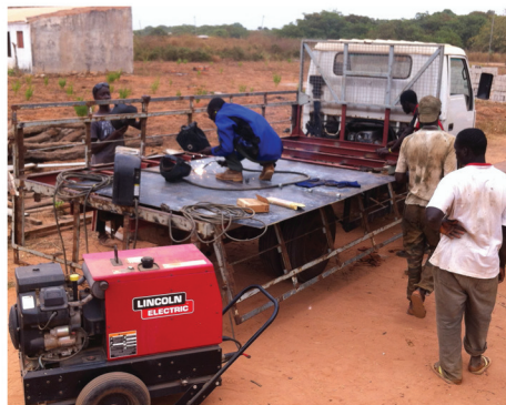
Welding the new steel bed Jason designed for the WAVS truck