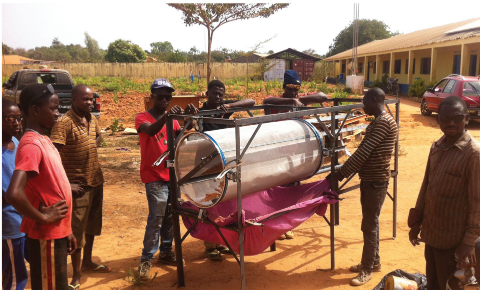
The sawdust screening trommel we made for the drinking water filter factory