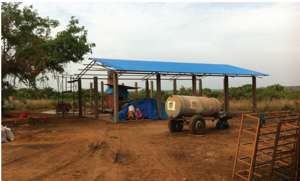
The drinking water filter factory with half of its roof installed