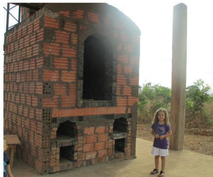
Savannah stopped by the factory construction site and was impressed by the almost-done kiln.