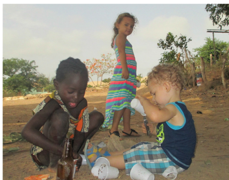
Everybody loves playing in the sand!