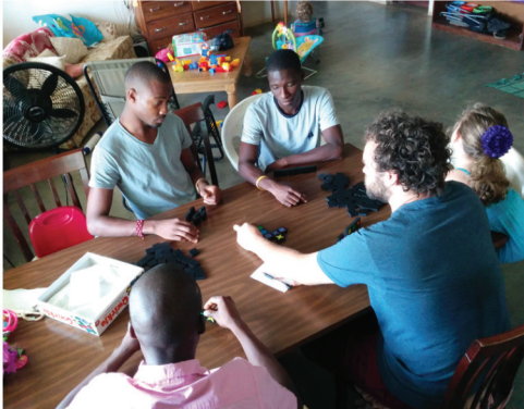
Three friends from Bissau came for the day of games, food, and swimming in our river last Saturday.