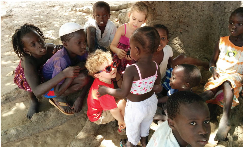
The standing little girl was telling a story and the other kids were all listening.