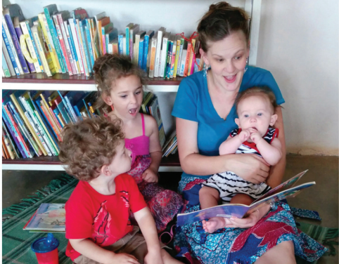
Everyone loves story time with Mommy.