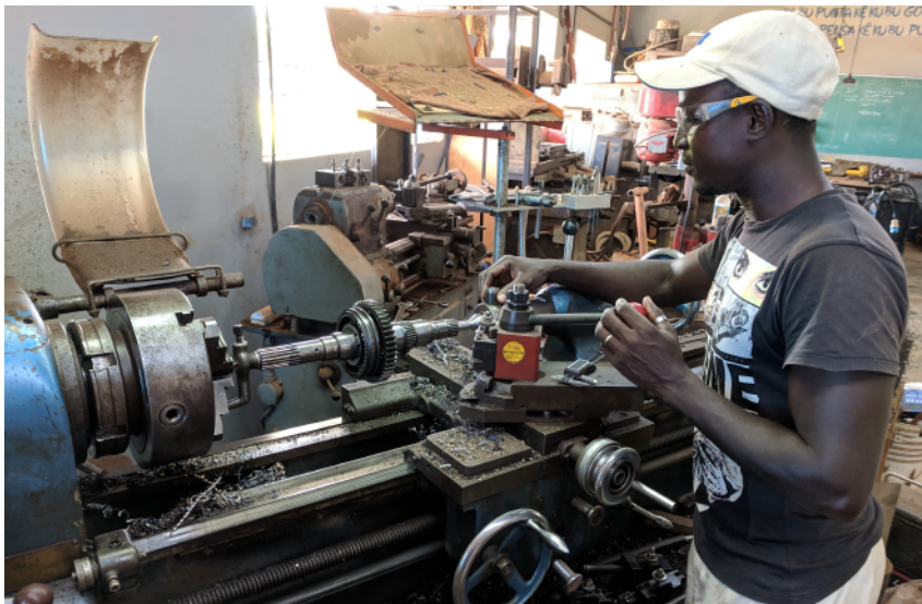
This gearbox shaft had a worn bearing seat which needed to be reduced and a custom bushing mated over it. The end result was perfect!