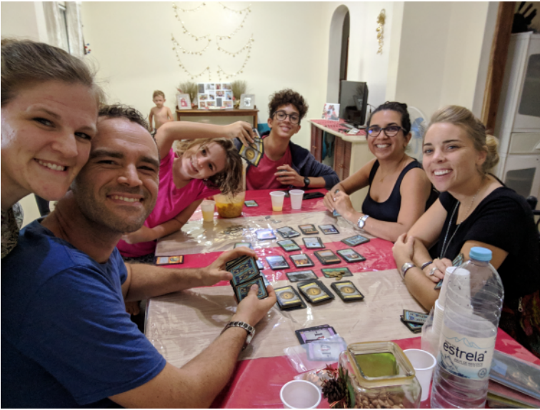
Many board games were played over the Christmas break!

... their lives and through their ministries.