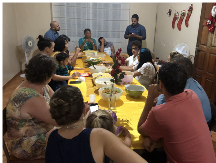
All of the adults around the table for the Christmas eve communion and feast.

On Christmas Eve all of the adults took communion together and prayed for the work of the Gospel in our own hearts and all across Guinea-Bissau. The majority of the missionaries around the table with us have been in Guinea-Bissau for 8, 10, or even 12 years (though we did have some newer people too) and it was exciting for me to look around and think about all that God has done in