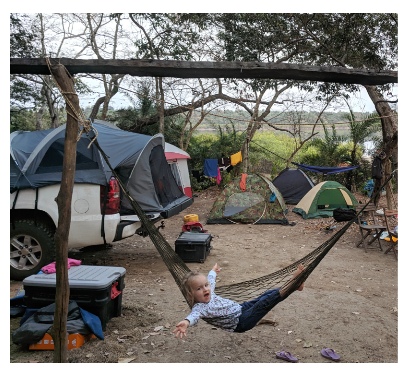
Miriam loved this net hammock and spent hours in it while we were camping.

used every day to fill the cups and water bottles of staff and students with clean drinking water! It is a fun intersection of two projects that we have invested in for years and are making an impact in Guinea-Bissau.