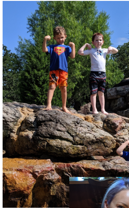
Left: The Huggins boy-cousins dominating the splash pad.