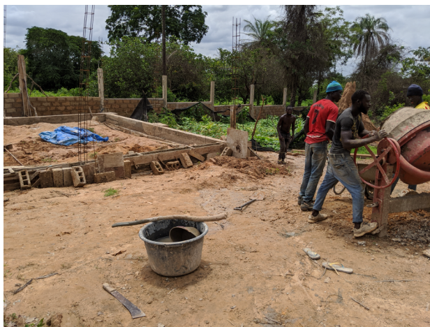
A few more pictures from 2020 base construction!

The trip will be a busy sprint to get as much done as I can, but we're thankful for the opportunity to be able to do it!