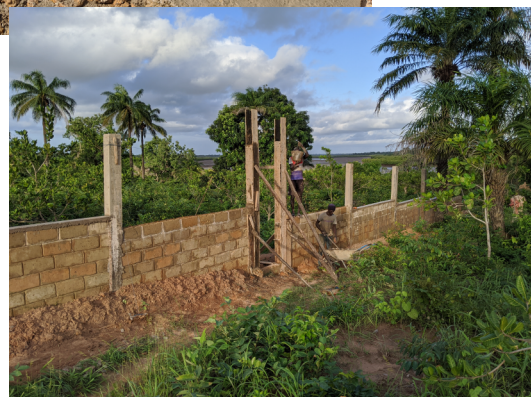
August: Forming columns for a doorway in the perimeter wall.