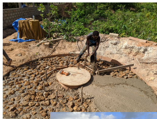
June: Pouring the apron to protect the well from surface water infiltration.