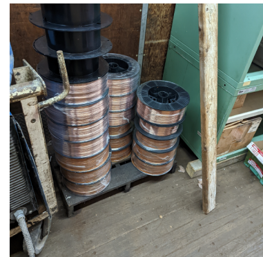
I just finished a little project using a homemade rig and a drill to respool approximately 160,000 feet of welding wire from bulk 1000 pound bins (bought cheaply at auction) onto the individual rolls our welders use. I'm glad both to have lots of welding wire for the shop and also to be done with that project!