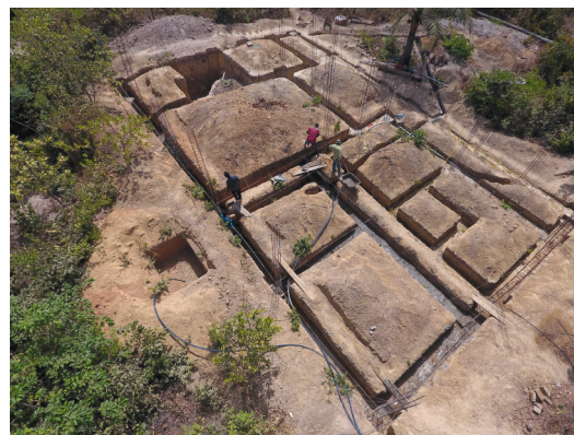
The footings for our family house are poured and we're excited to continue work on it when we return in November!

We have several years ahead of us before we reach the end of the principal construction. We're glad to have the funding in hand and for the progress that has been made already. We're looking forward to the way the journey and final product will be used to help build God's kingdom in Guinea-Bissau!