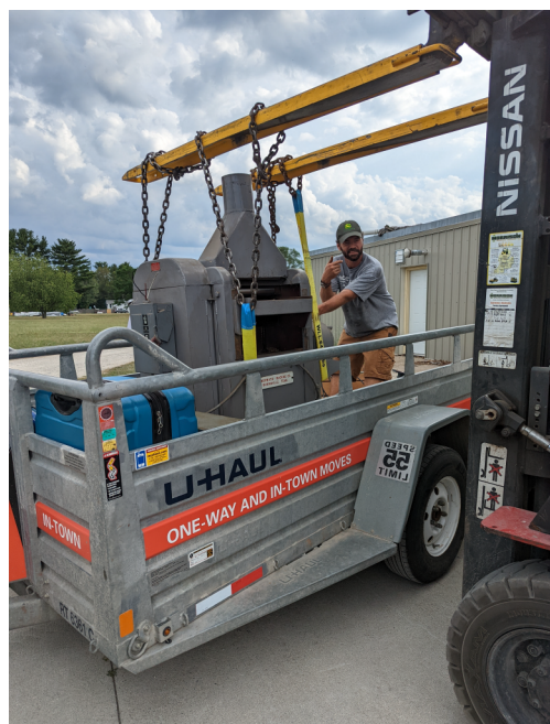
This 1960's era wood planer will be one of the main machines in our fledgling carpentry shop which will build many of the wooden things needed for our construction as well as the wooden parts of the gradeschool desks we make in the shop!

Please pray for wisdom and endurance in our remaining two months in the U.S. There are many decisions left, many things that need to be identified, ordered, and packed, and a limited amount of time in which to do them. Please also join us in praying for the logistics of the process. We already know there have been some new taxes added to the import process in Guinea-Bissau and are also having trouble securing a freight quote for the container shipping. Global shipping has been less stable in the last few years. In the meantime, we can't wait to collect all of the things we need to put into the container until the last minute, so we're operating on faith that the freight companies will eventually be able to get their ducks in a row and find a route for the container to travel.