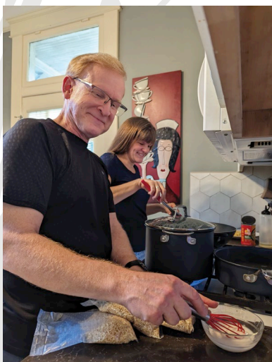
Cooking with Dad.

Over Father's Day weekend, dad, his 4 kids, and their families - 17 people in all - packed into Dad's house for a sibling / cousin / dad / grandad extravaganza. It was great to see everyone and I was relieved to find out that I am still taller than all of my nieces and nephews (barely, haha).