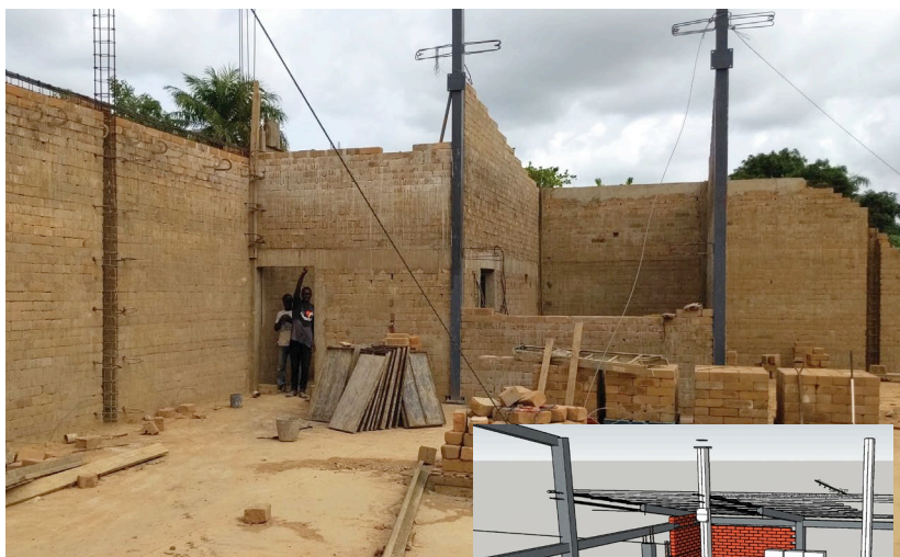
Amadu and Libani in the doorway of my new office, which is looking more and more like the drawing every day!

Though the pace will be slower while we're away, it's a big blessing that we have a team making forward progress and keeping an eye on things while we're gone.