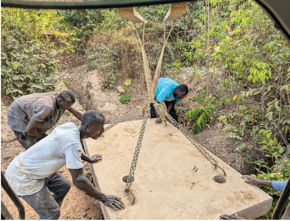
We had cast the concrete septic tank lid previously and were waiting to install it until the leach system was set up. The day arrived, and the tractor was the key to success!

Another small but important step this month was sealing up the septic tank that will serve the bungalows and the eventual bunk house for hosting guests! Sealing the tank will allow us to install the first toilet at the site (in the bungalow). This not only paves the way for our first guest in the almost-completed first bungalow, but also gives us a spot when the need arises.