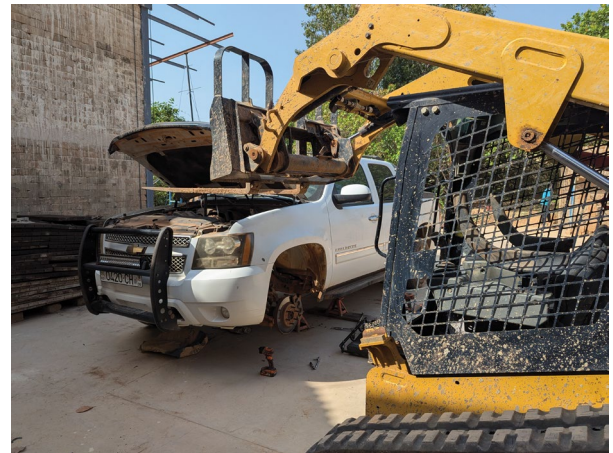
When you don't have an engine hoist, you get creative!

Before we left for furlough last year, I'd begun feeling a bit of slop in the motor of our truck when beginning to accelerate. Fortunately, I had already sent a spare motor mount knowing that's a common failure point with our vehicle. When we returned, it was much worse and I knew the time had come. Although I don't have a transmission jack to be able to lift the motor up the couple of inches I needed to create the separation required to swap the mount, the tractor was ready to help and did a great job! Not a fun job, but certainly necessary!