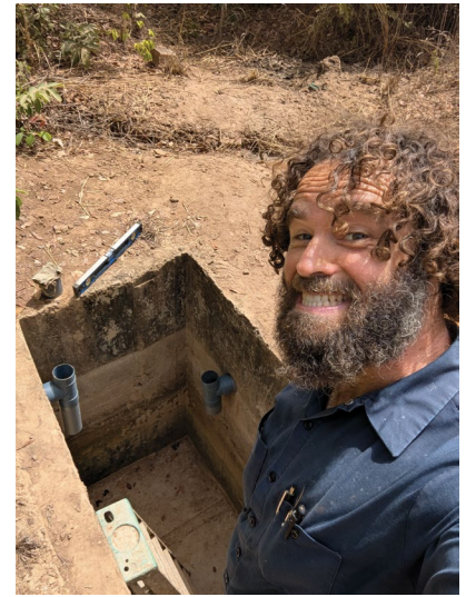
There's nothing especially exciting about a hole in the ground, but a first working toilet at the site will be a big step!