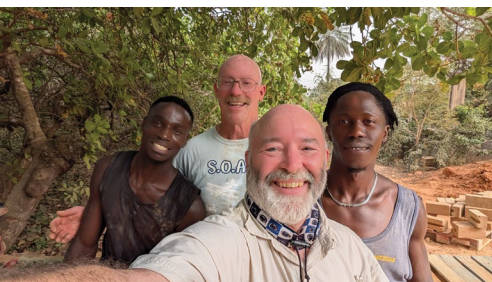
It's been fun watching relationships grow as several team members have invested the effort to make the trip multiple times.