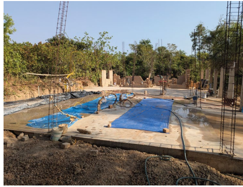
Above: The completed house slab curing. Right: Libani using the plumb bob to transfer alignment stakes onto the slab to locate an interior wall.

After we were done ponding water on the newly-finished house slab the first week of February to help it cure, we spent some time carefully trueing up the square of the house and setting the blocks that would form the corners. With those key blocks mortared in place, we were able to verify and tweak the positions of all of the interior walls. With first and last blocks of the first courses set, we were ready to run string lines and start building walls. So exciting!