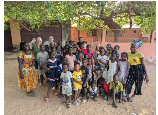
Hot, dusty, happy kids after several hours of very active outdoor games.