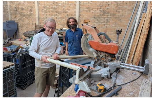
Chuck and I did some problem solving to figure out how to insulate hot-water pipes inside a solid block wall.