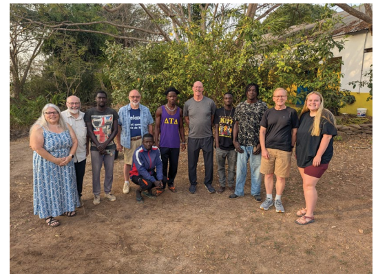
The team from Simpson Park had a great time working together with the guys from Project Hope.