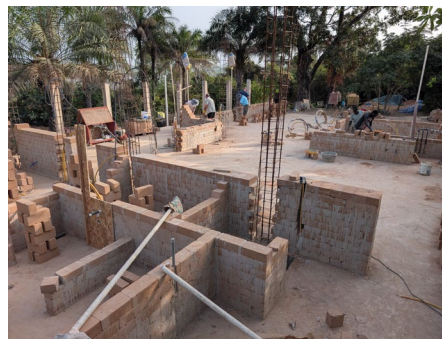
The walls of the house all getting taller!