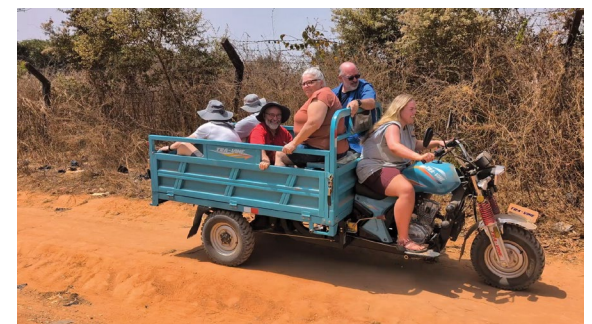
Ferrying the team to lunch at our current house in Project Hope's moto-truck-trike.