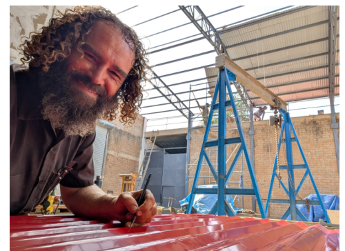
After carefully squaring the middle sheet together, the guys marched across while I cut partial sheets to finish the runs.