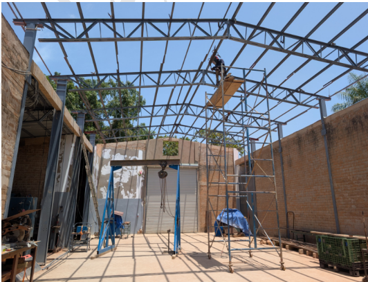
After the last joist was hung, we welded the purlins all down to prepare for the first roofing sheet.

In our previous installment, we left you with the structure of the final, central section of the new shop's roof half done and no roofing installed while the first rains loomed only a month away. I'm happy to report that after an exhausting May, we were able to complete the roof just in time to keep the contents of the shop dry from the first rain. We worked on it right up until the day before we left Guinea-Bissau in a 4am bush taxi! My guys actually installed the last few roof panels without me while we were in the car leaving the country.