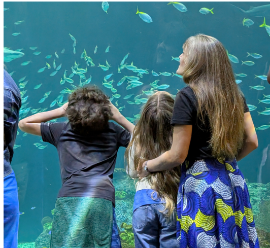
Admiring the fish at Shedd Aquarium in Chicago.