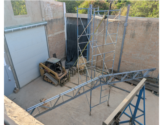
Setting the 2nd-to-last joist using the scaffolding-hoist counter-weighted by the tractor!

Finally, though we still have more construction to do, the finished shop will let us begin some of the programs we have planned for it, including beginning to bring community iron workers in for periodic training events to help them expand their skills and learn the capabilities and opportunities of some of the machines we have which they don't, which we will provide them access to. (cont'd)